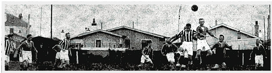
Waterside vs Petone 1934

PROFESSIONAL SIGN MANUFACTURERS AND INSTALLERS