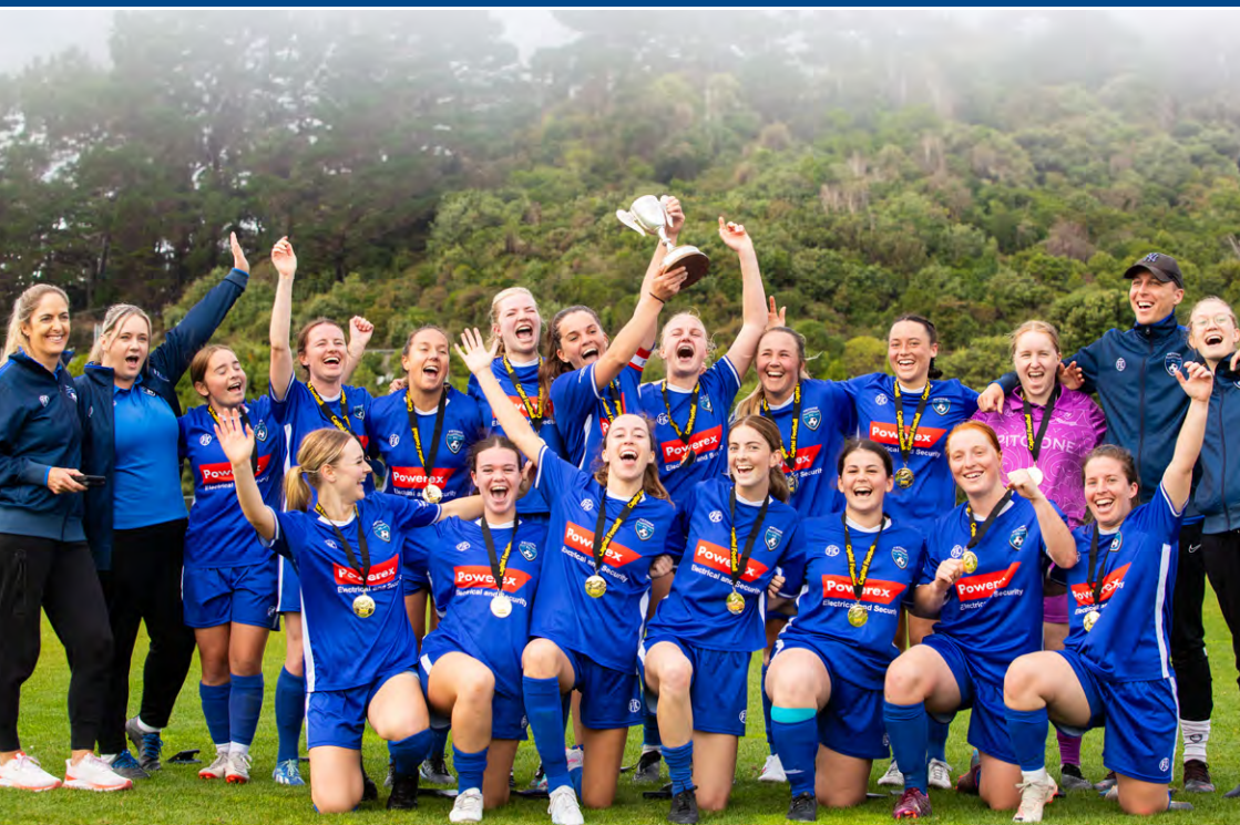
Petone Powerex First Team