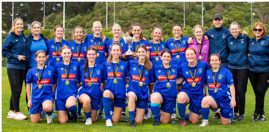
2024 Kelly Cup Winners — Petone Powerex

2-4 vs Wellington United Diamonds 10-1 vs Miramar Rangers 0-1 vs Waterside Karori Reserves 1-2 vs Seatoun (BOWL 3rd/4th)