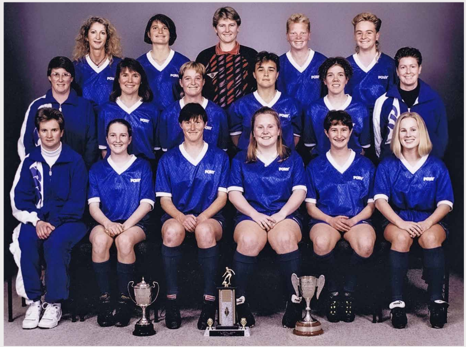
1994 Women's First Team — Central League winners