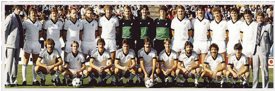
New Zealand 1982 World Cup Squad