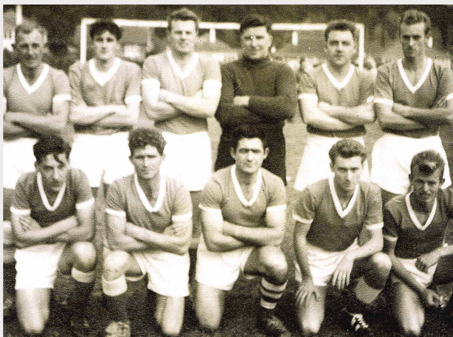
Petone FC First Team early-1960s