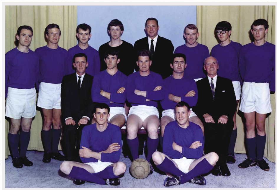
Petone FC 1967 Division Two Winners