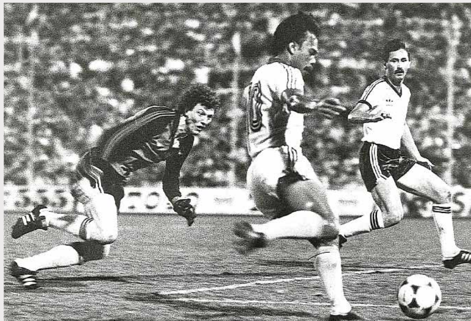
New Zealand vs Malaysia 1981

My coaching roles included one season as First Team coach followed by two seasons as National League assistant coach at Hutt Valley United. I've also been a junior coach for 14 years and goalkeeping coach for ten years.